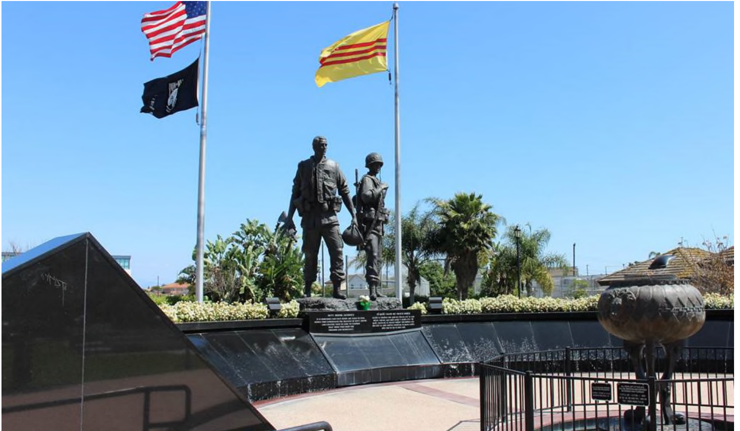
On April 27, 2003, a Vietnam War memorial was unveiled at Sid Goldstein Freedom Park in Westminster.