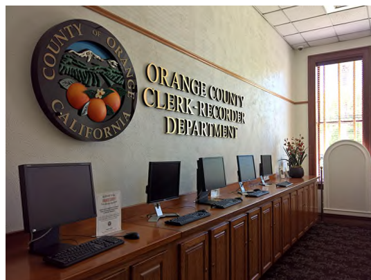
Our marriage and passport services office inside the Old County Courthouse is open during our once-a-month Saturday openings.